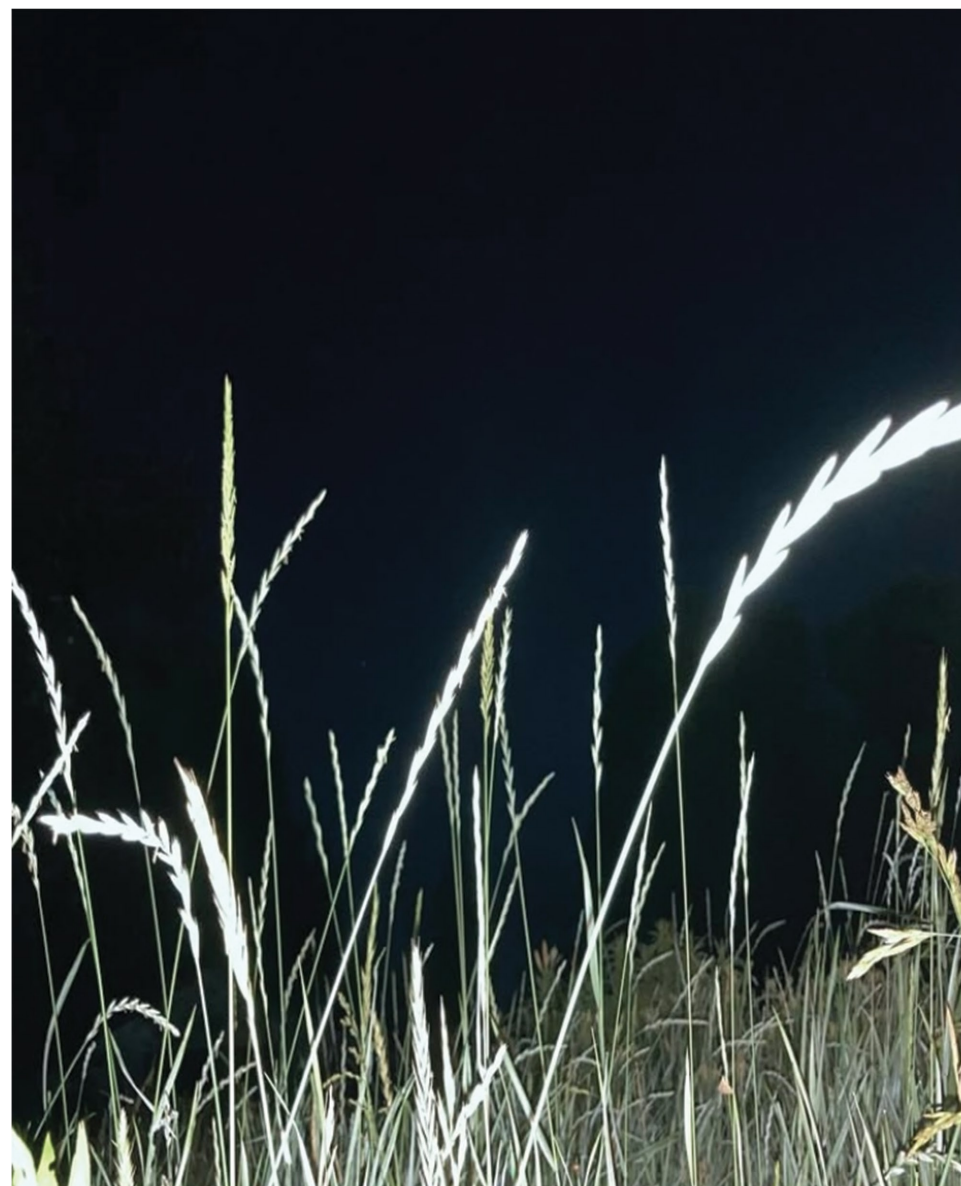
side of road