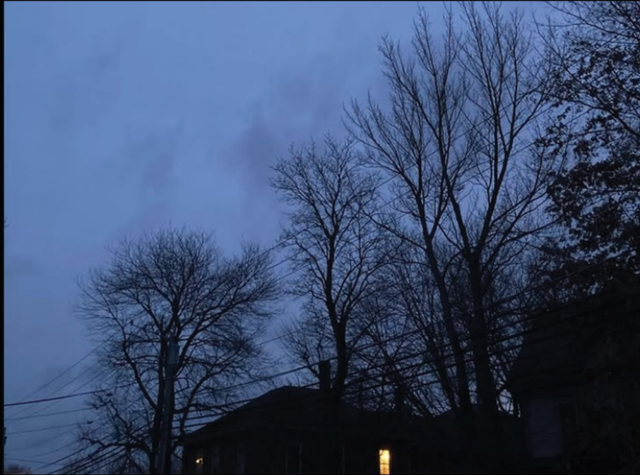
Dusk is best for shenanigans