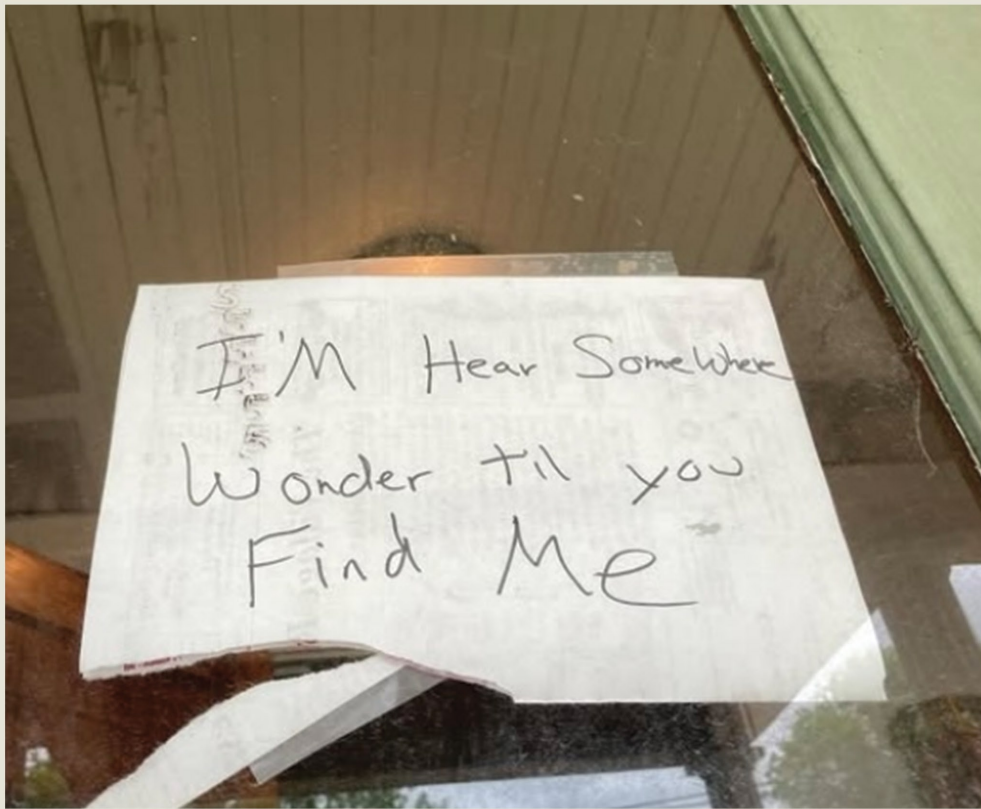
Sign on the door of the Opera House

I'M HEAR SOMEWHERE WONDER 'TIL YOU FIND ME