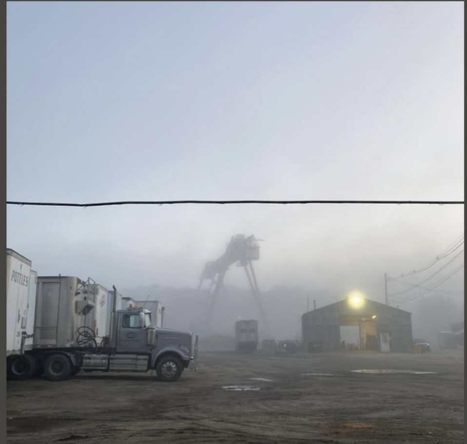
Dixfield Log Mill Early foggy morning now playing - "Front Load" by Arca